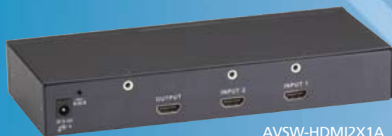
AVSW-HDMI2X1A (back view)

The diagrams below show the back and top view connections.