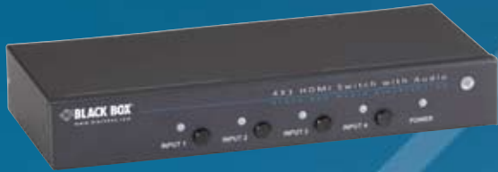
AVSW-HDMI4X1A (front view)