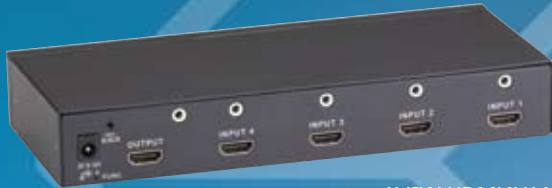
AVSW-HDMI4X1A (back view)