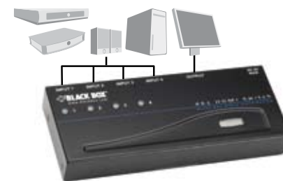
4-Port HDMI Video Switch (no audio) (AVSW-HDMI4X1)