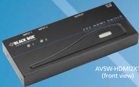
AVSW-HDMI2X1 (front view)