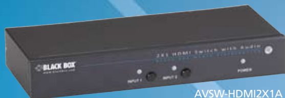
AVSW-HDMI2X1A (front view)