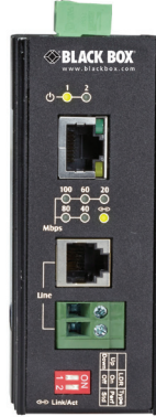
Figure 1. Front view of the extender.