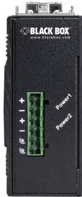
Figure 2. Top view of the extender.