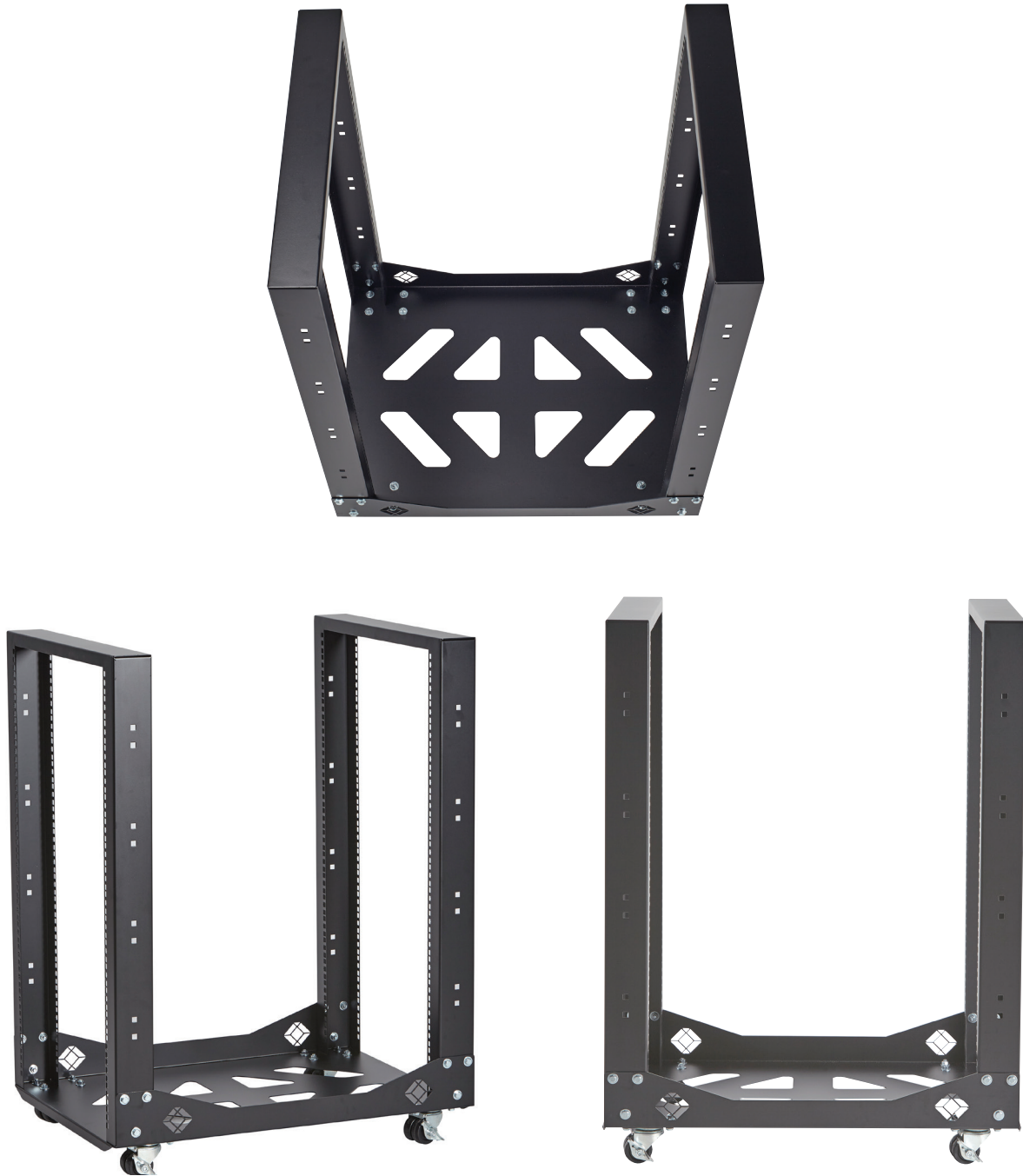
Mobile Open Rack - 4-Post, 19U (RM225A), top, angled front, and straight-on front views