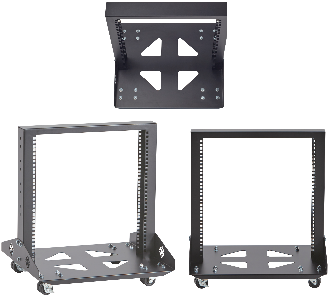
Mobile Open Rack - 2-Post, 11U (RM210A), top, angled front, and straight-on front views.