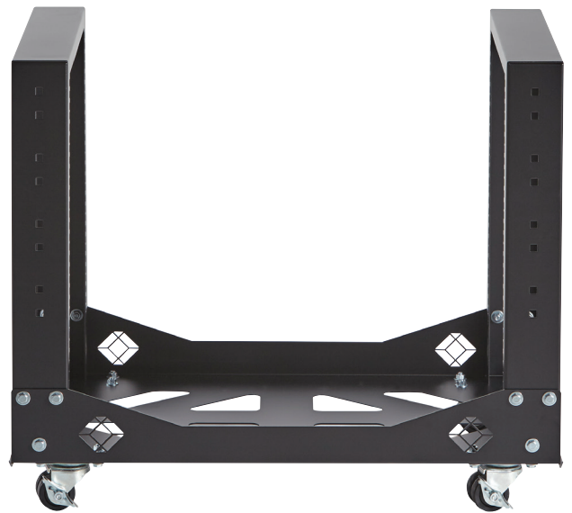
Mobile Open Rack - 4-Post, 11U (RM215A), top, angled front, and straight-on front views.